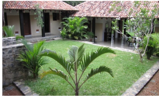
Tropical Courtyard at Moonhill