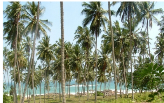
View from the garden