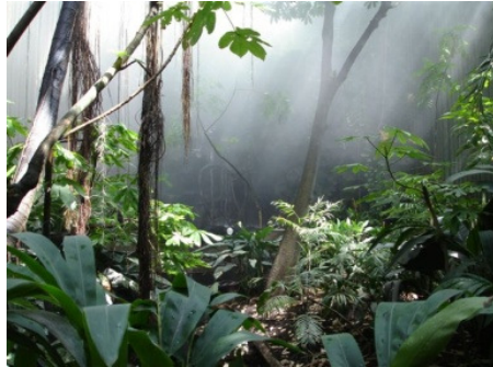
Enjoy a Day excursion to Sinharaja Rainforest for both, Painters and Non-Painters

Discover the delights of the beautiful tropical island of Sri Lanka with excursions to ancient temples, national parks and the rainforest with its extraordinary diversity of plants, birds and animals.