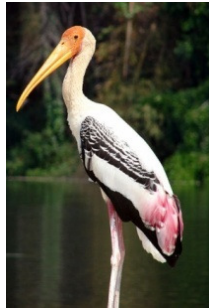
Amazing wildlife at Yala National Park Non-Painters Excursion