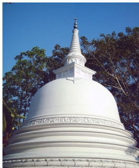
Non-Painters Excursion to Mulkirigala Rock Temple